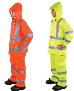
PVC Nomex available in florescent orange or yellow.

**Other sizes are available, contact factory or local Salisbury representative for availability.