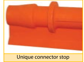
Unique connector stop

The unique "connector-stop" molded into one end prevents covers from overlapping during installation. This eliminates wasted time moving trucks to re-connect sections that did not couple correctly. This cover is also compatible with Salisbury 1.5" I.D. class 3