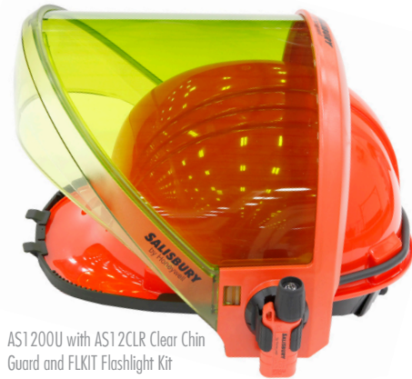
AS1200U with AS12CLR Clear Chin Guard and FLKIT Flashlight Kit