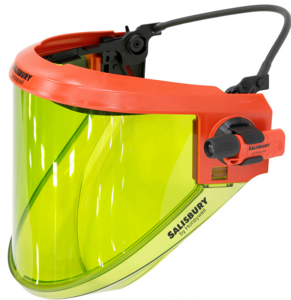
AS1200U with Optional Accessories; AS12CLR Clear Chin Guard and FLKIT Flashlight Kit