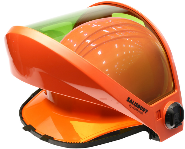
AS1200U - Hard Hat Not Included

Anti-Fog Inner Lens: The attachable inner lens includes an air spaced design that decreases fogging. The inner lens meets ASTM requirements for Anti-Fog Lenses.