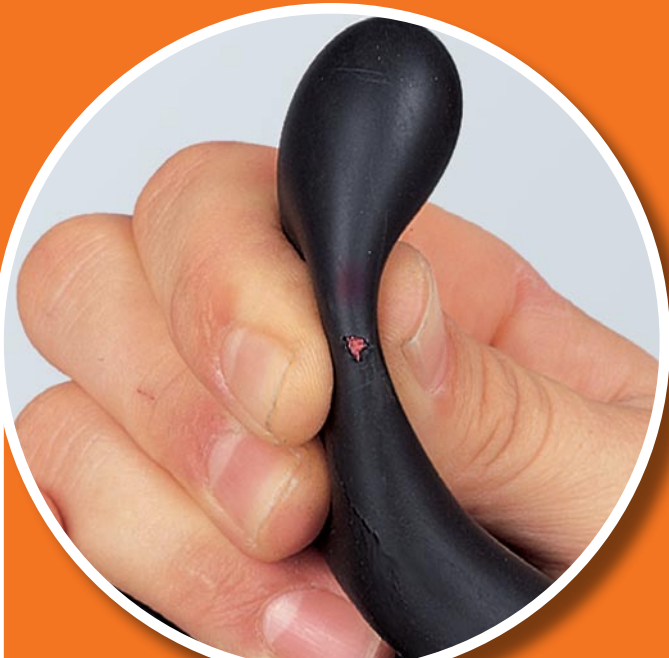
Snags: Damage shown here is due to wood and metal splinters and other sharp objects.