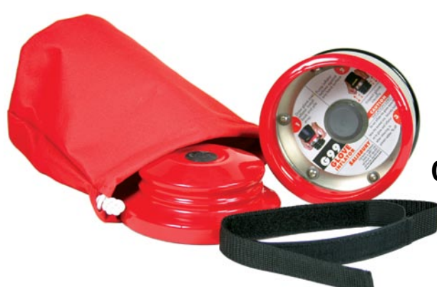
G100 Portable GLOVE INFLATOR KIT

MAXIMUM INFLATION SIZE: Type I Gloves: 1.5 times normal Type II Gloves: 1.25 times normal