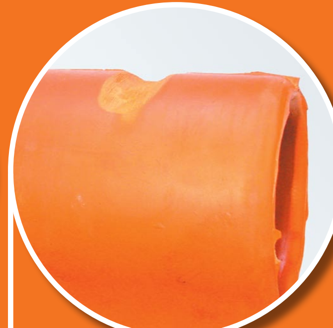
Physical Damage: Rope burns, deep cuts and puncture hazards are cause for rejection.