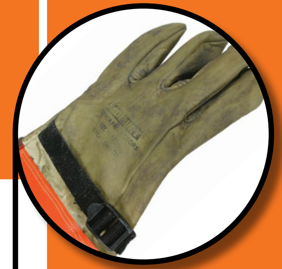
Contamination: Discard protectors contaminated with oil or petroleum compounds.