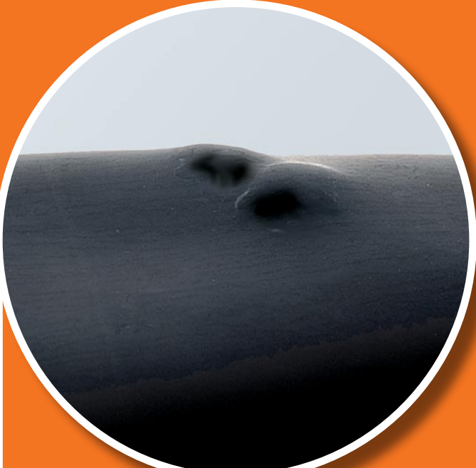
Chemical Attack: This photo shows swelling caused by oils and petroleum compounds.