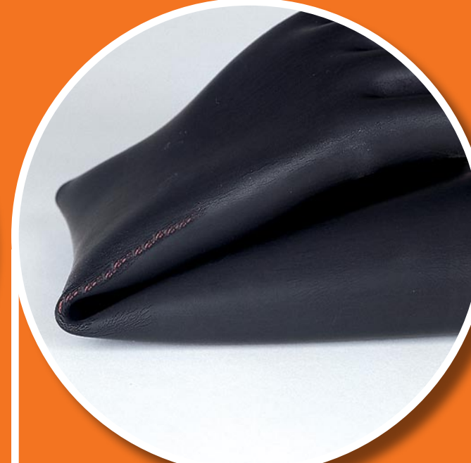
Avoid Folding: The strain on rubber at a folded point is equal to stretching the rubber to twice its length.