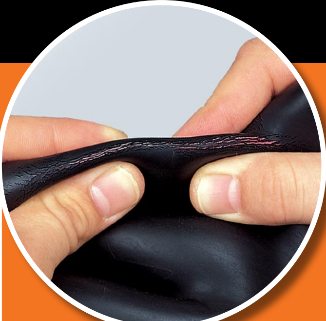
Cracking & Cutting: Shown above is damage caused by prolonged folding or compressing.