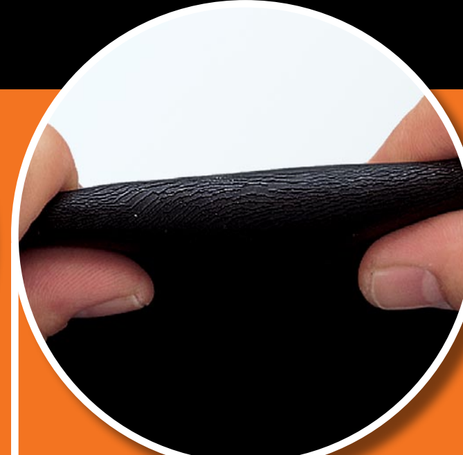
UV Checking: Storing in areas exposed to prolonged sunlight causes UV checking.