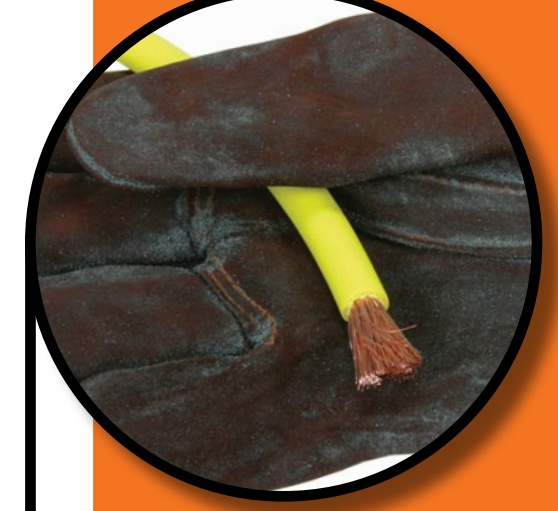
Embedded Wires: Inspect for embedded wires or metal shavings that could puncture rubber gloves.